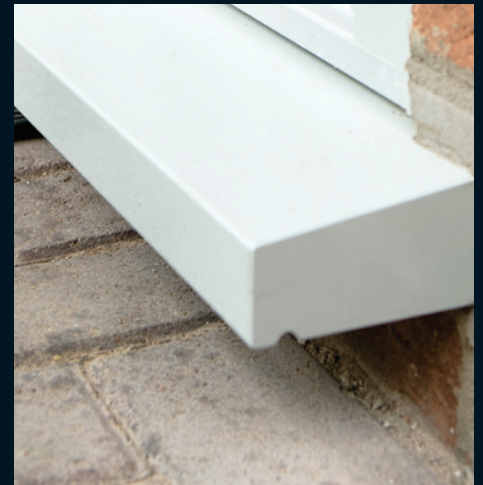
55mm Radlington cill option