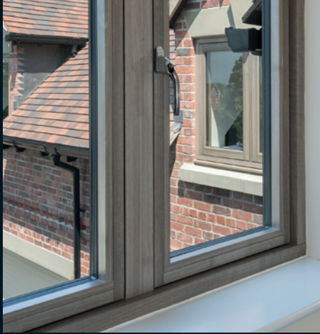
Straight lined innovation, bold looks create a bright living environment