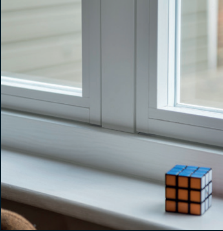
Very clear design with a cutting edge internal shape it is unconventional and unique

Flush2 is the architectural highlight of the Residence Collection, with clean lines and superb performance. With a flush external casement design and a square edge internal finish they are ideal when replacing 100mm traditional timber windows. A choice of styling options make them suitable for period and modern properties.