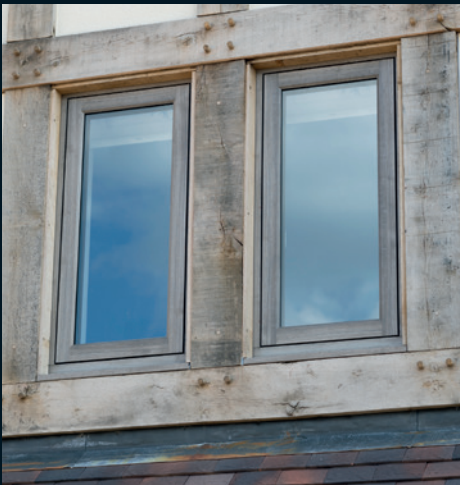
New complementing the old