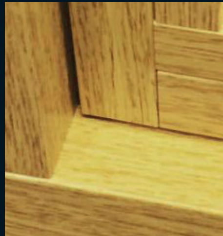
Feels elegant and timeless for those wanting a contemporary look in a traditional building