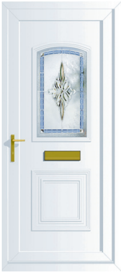
Victorian with Cobalt Glass (BP)