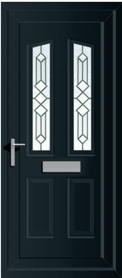
Windsor in Black with Atria Glass (DB)