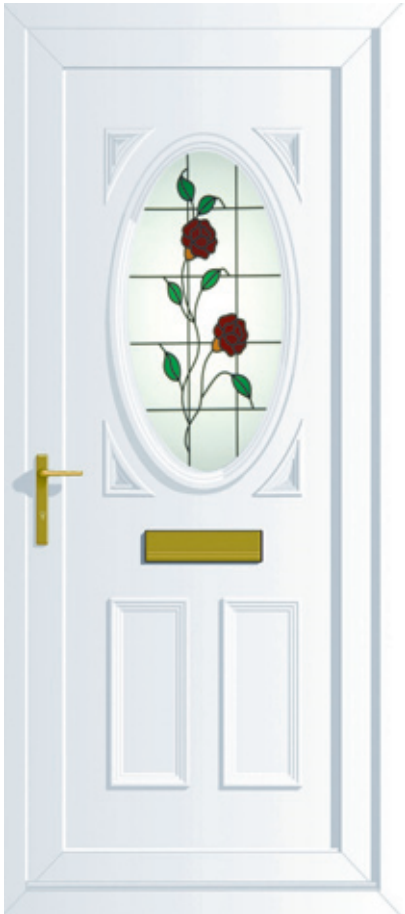
Warwick with CD21 Glass