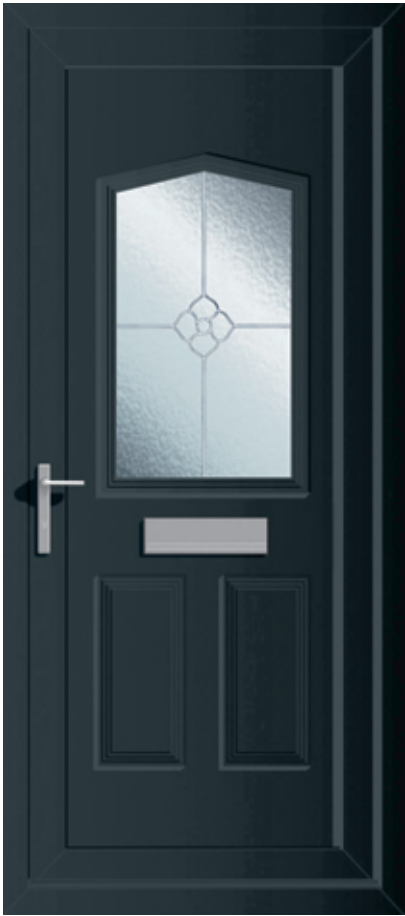
Jacobean in Anthracite Grey with Silver Grille Glass (DB)