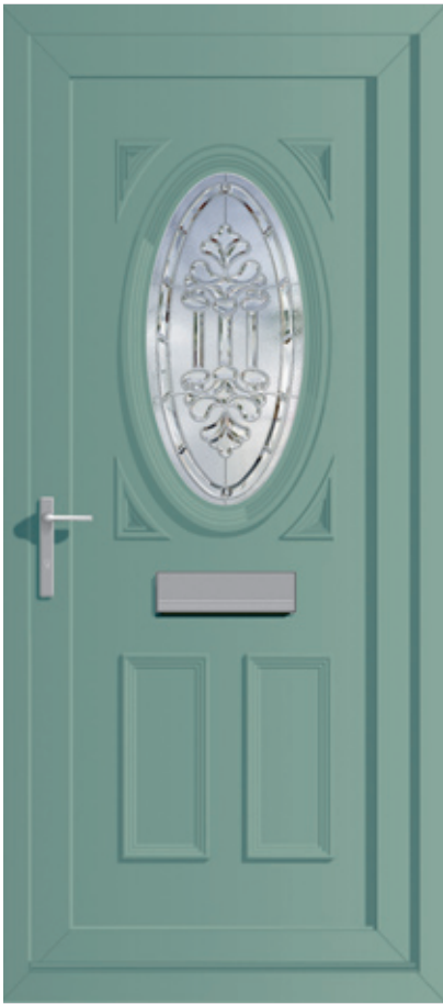
Warwick in Chartwell Green with Aquarius Glass