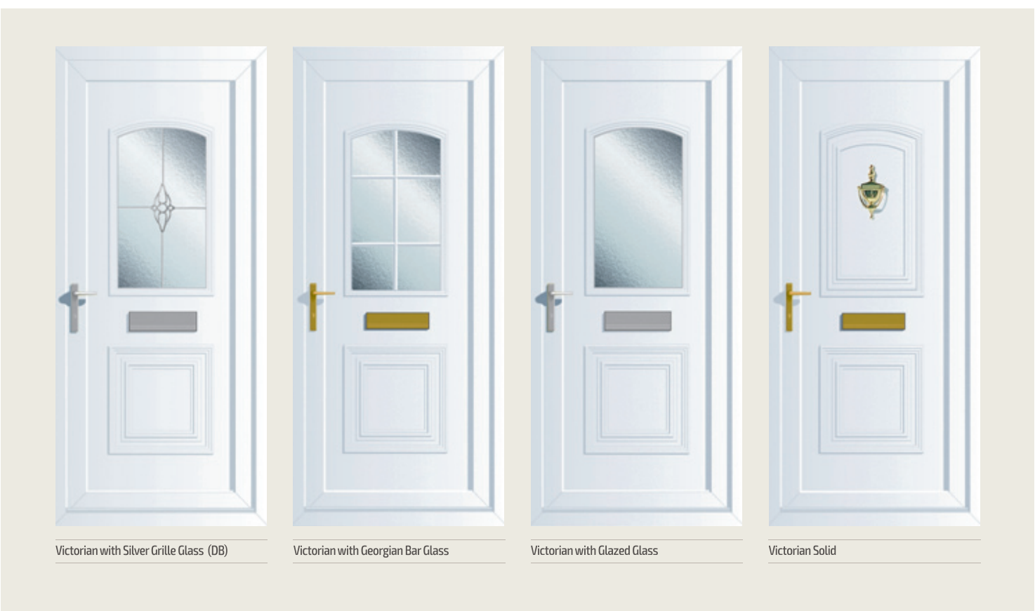
Victorian with Silver Grille Glass (DB)