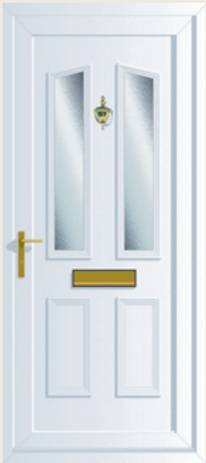
Windsor with Glazed Glass