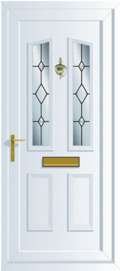
Windsor with Bevel Cluster Glass (DB)