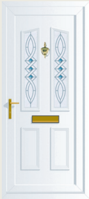
Windsor with Sapphire Twist Glass (DB)