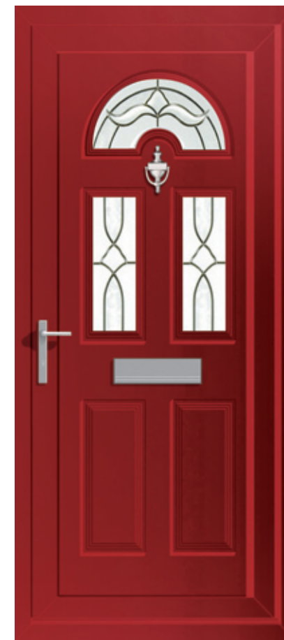
Georgian 3 in Red with Sirius Glass (DB)