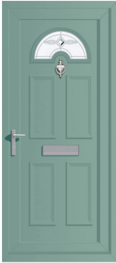
Georgian 1 in Chartwell Green with Clear Elegance Glass (DB)