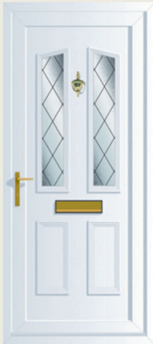
Windsor with Diamond Lead Glass