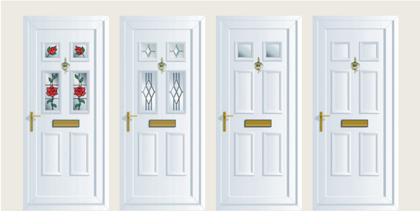
Edwardian 4 with Climbing Rose Glass (CD)