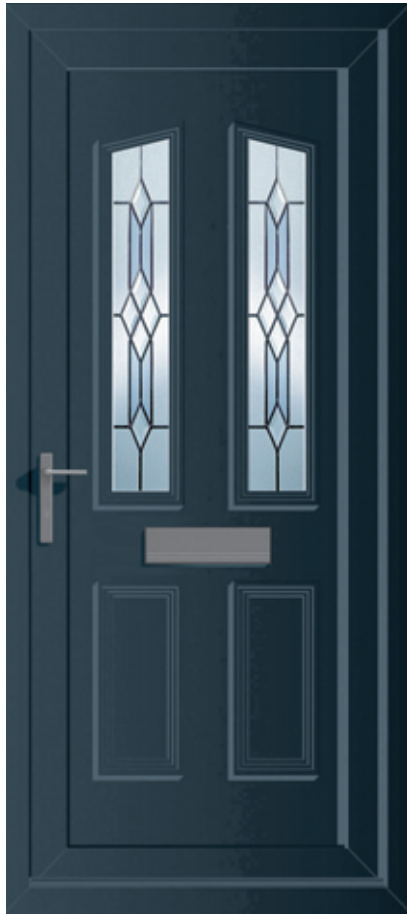
Windsor in Anthracite Grey with DB4 Glass