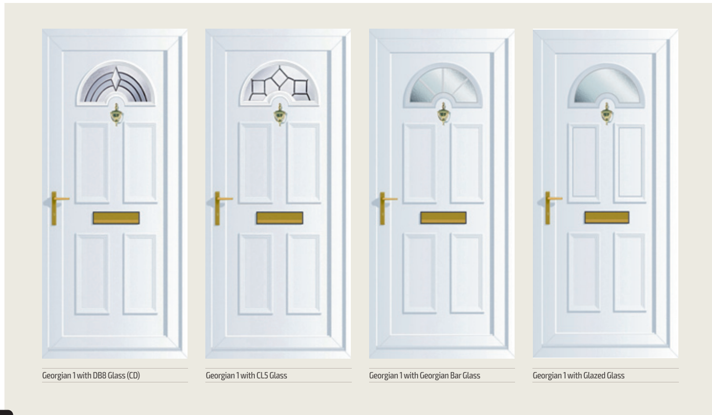
Georgian 1 with DB8 Glass (CD)