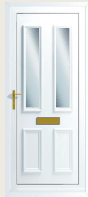
Monaco with Glazed Glass