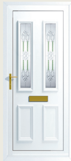
Monaco with BPS Green Glass