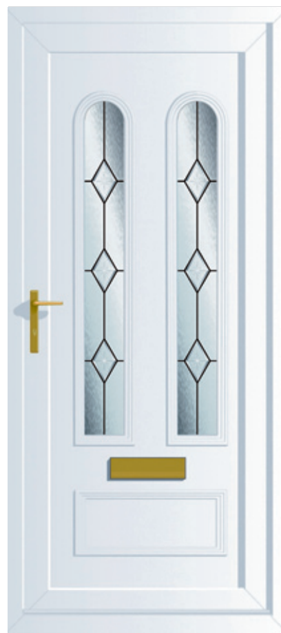
Cambridge with Bevel Cluster Glass (DB)