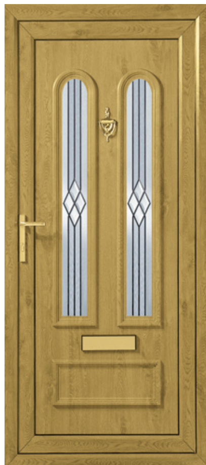
Cambridge in Irish Oak with DB1 Glass