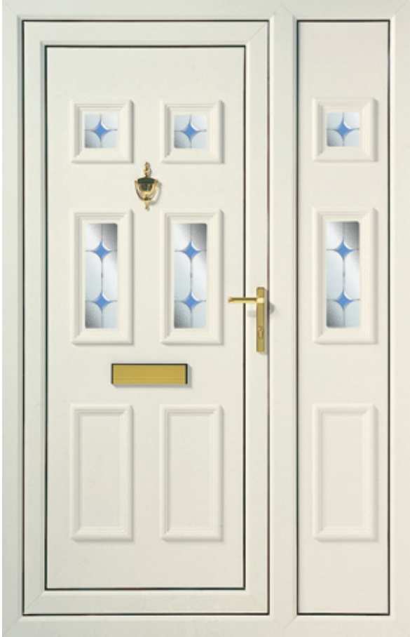
Edwardian 4 in Cream with Bevel G Glass (DB)