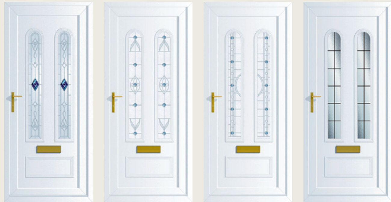
Cambridge with Fused Blue Glass (DB)