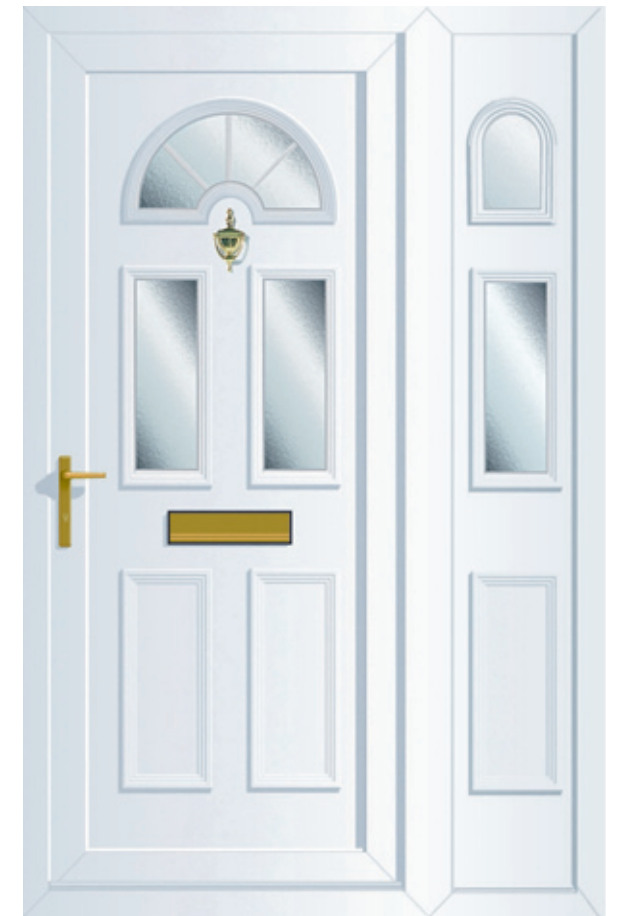
Georgian 3 with Georgian Bar Glass and Side Panel