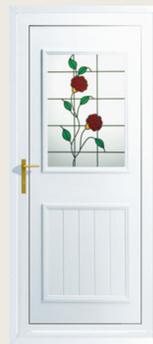
Back Door with CD21 Glass