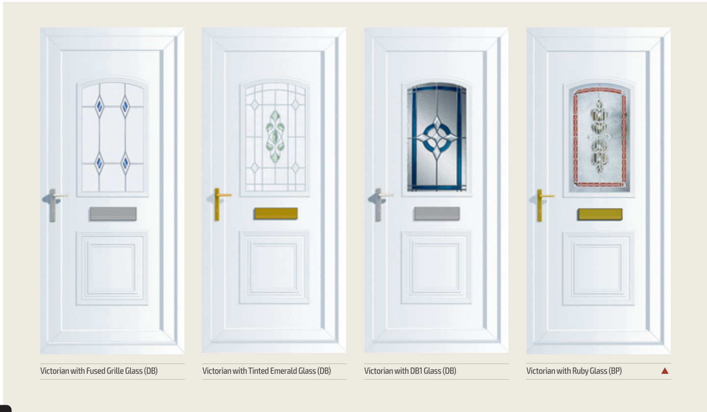
Victorian with Fused Grille Glass (DB)