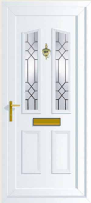
Windsor with CL5 Glass