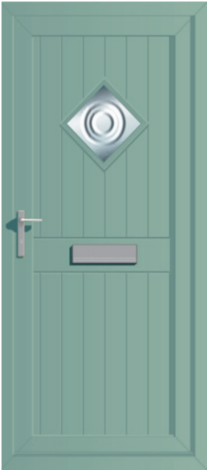
Cornwall in Chartwell Green with Bullion Glass (CD)