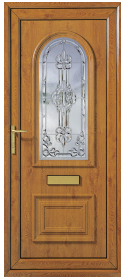
Devon in Light Oak with Venus Glass (BP)