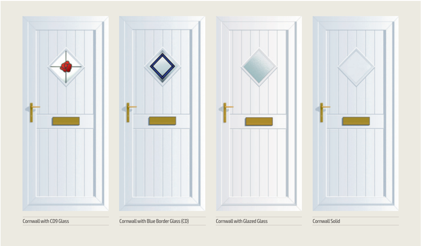
Cornwall with CD9 Glass