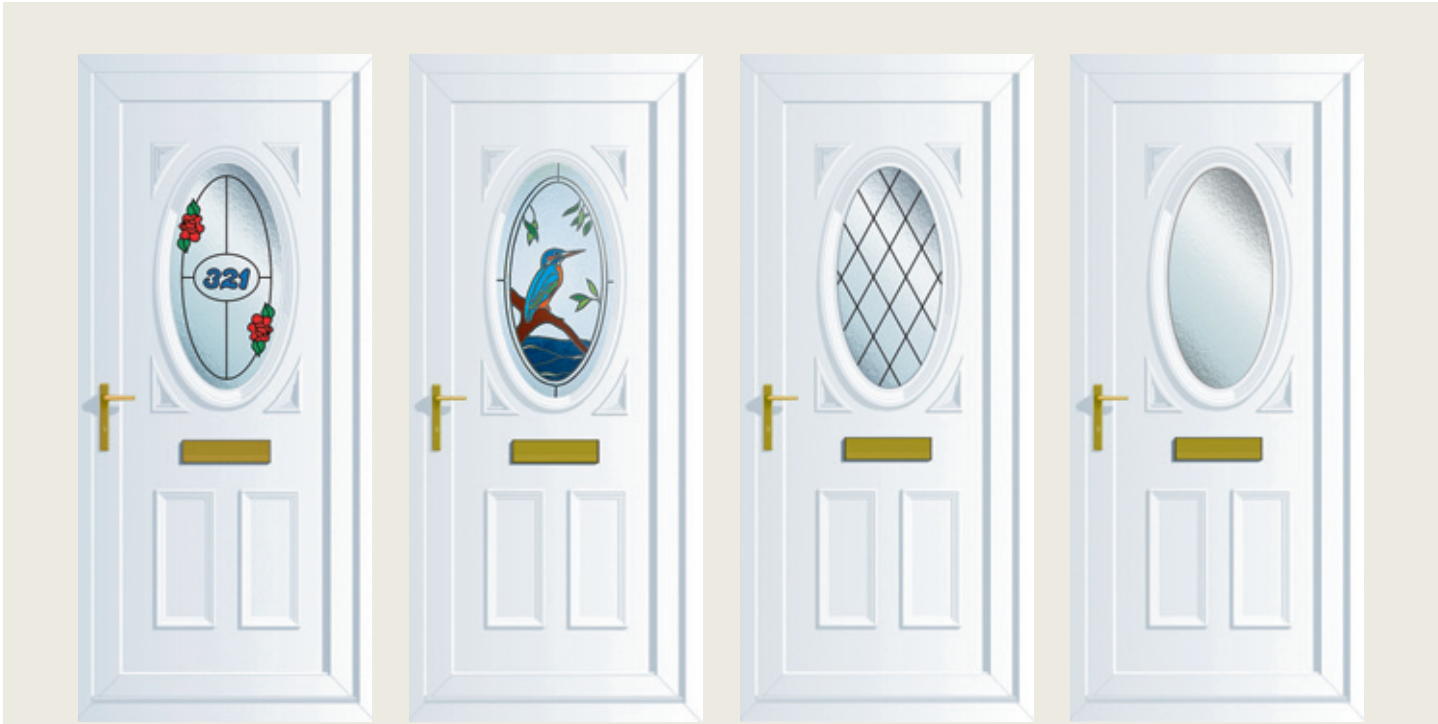
Warwick with House No/Roses Glass (CD)