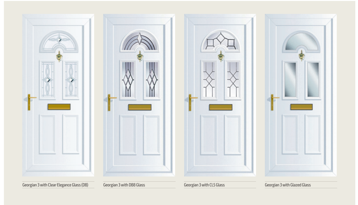
Georgian 3 with Clear Elegance Glass (DB)