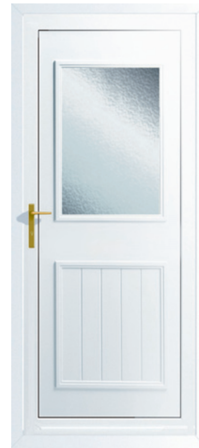
Back Door with Glazed Glass