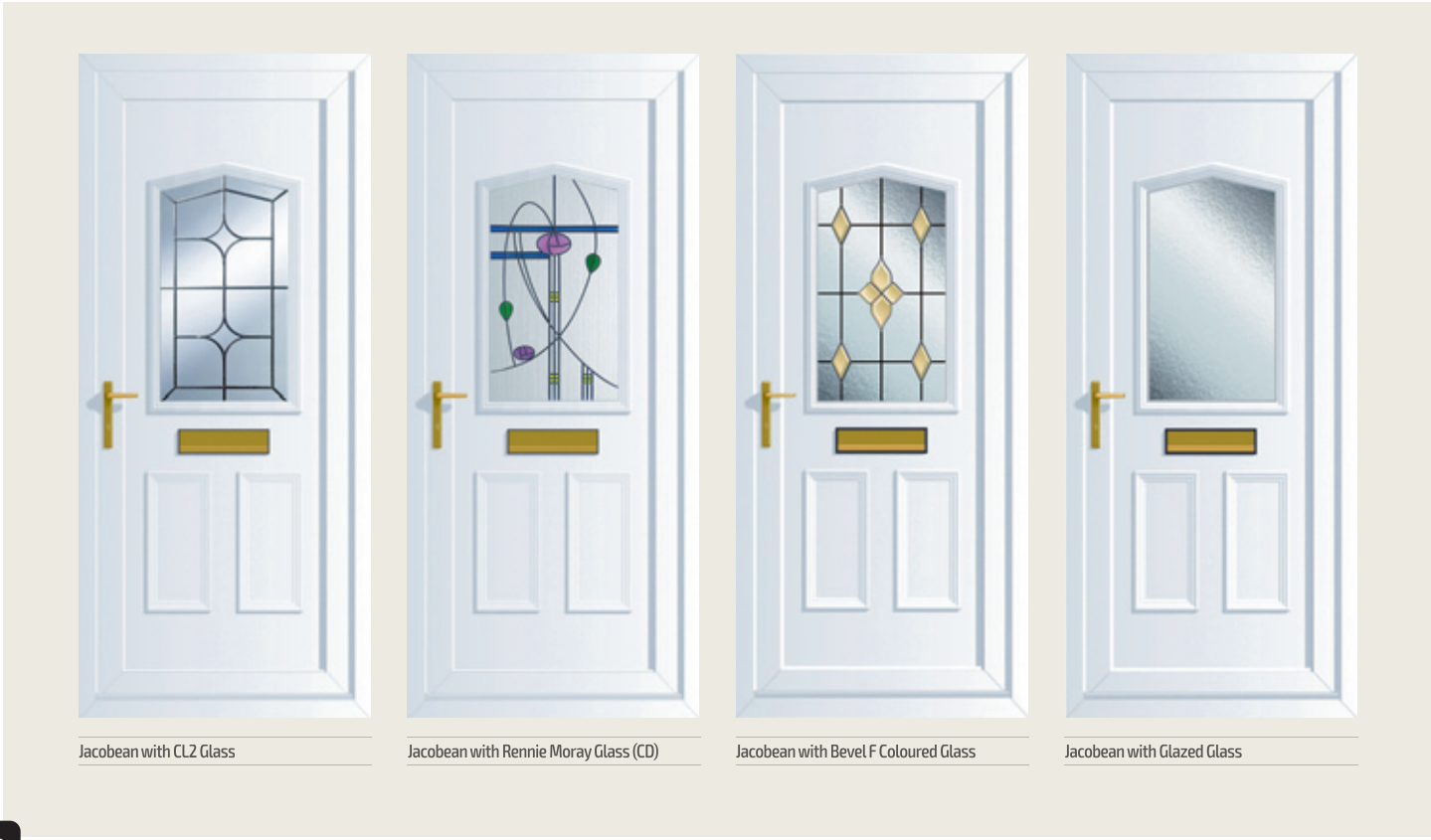
Jacobean with CL2 Glass