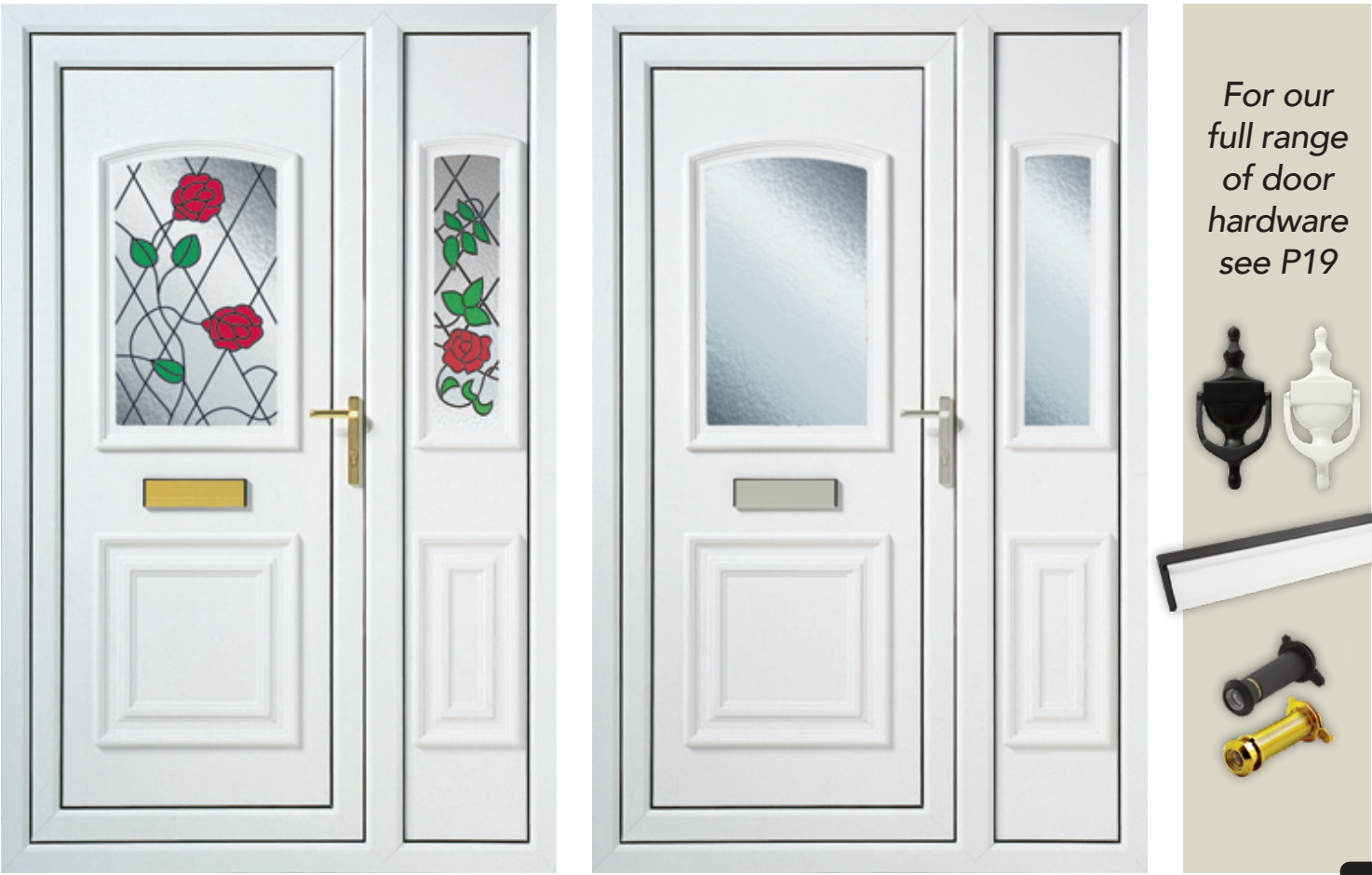
Victorian with Briar Glass (CD) and Matching Side Panel