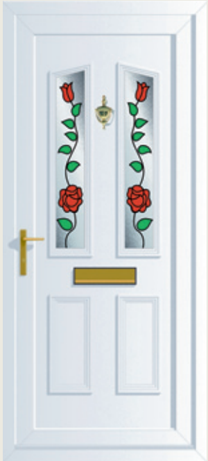
Windsor with Climbing Rose Glass (CD)