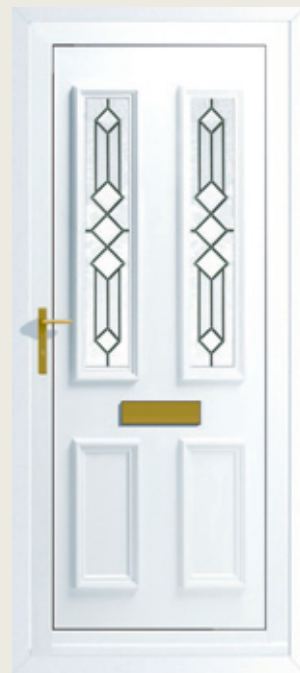
Monaco with Atria Glass (DB)