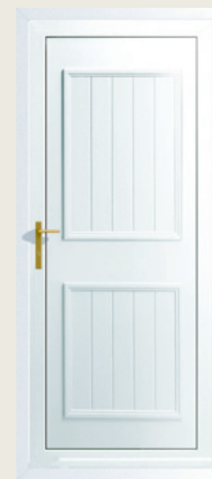
Back Door Solid