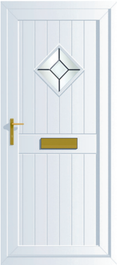
Cornwall with DB68 Glass