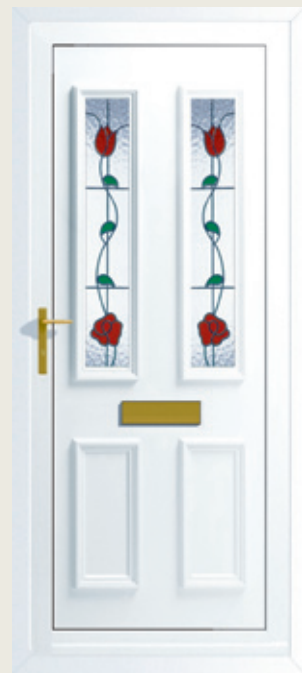
Monaco with Climbing Rose Glass (CD)