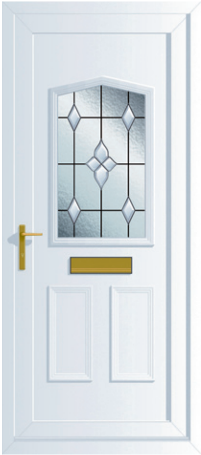
Jacobean with Bevel A Glass (DB)