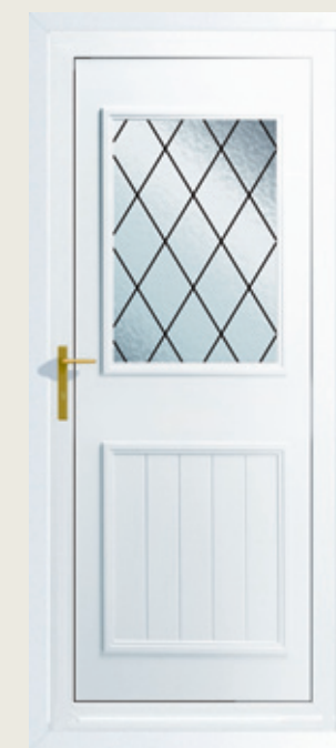
Back Door with Diamond Lead Glass