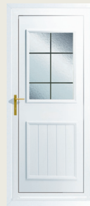
Back Door with Square Lead Glass