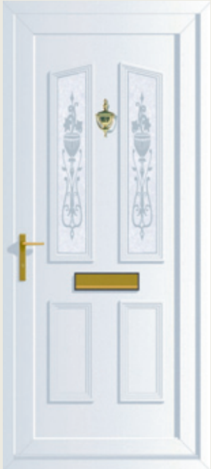
Windsor with Floral Urn Etched Glass (TD)