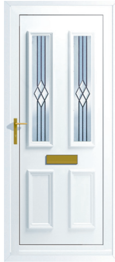
Monaco with DB1 Glass (DB)