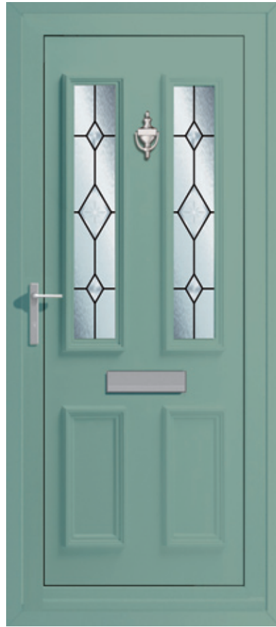
Monaco in Chartwell Green with Bevel Cluster Glass (DB)