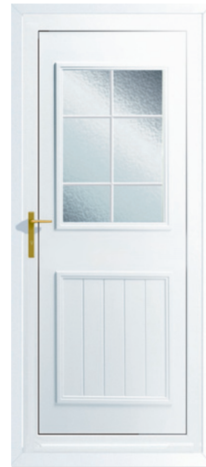
Back Door with Georgian Bar Glass