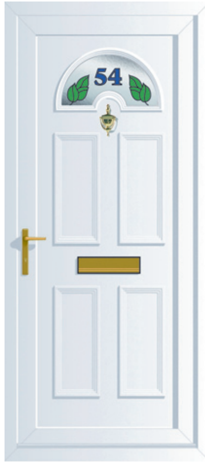
Georgian 1 with House No/Leaves Glass (CD)