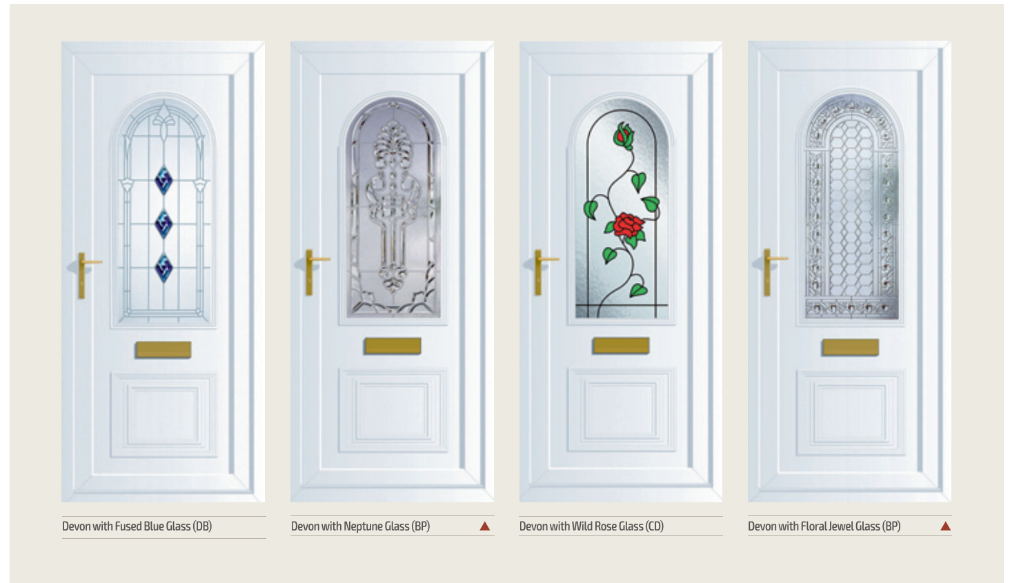
Devon with Fused Blue Glass (DB)