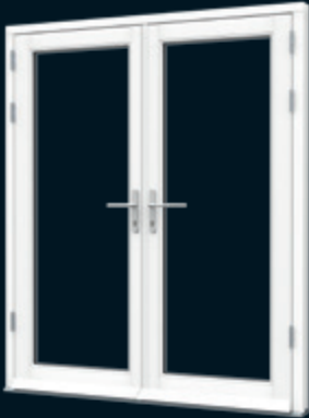
Full Height Glass