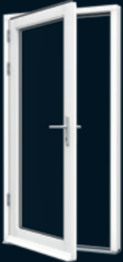
Full Height Glass