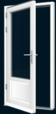
Part Glazed Raised and Fielded Security Panel