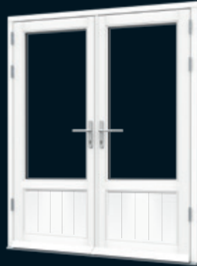
Part Glazed Grooved Panel