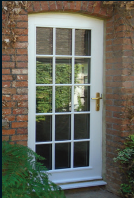
Timber single door with 15 pane Astragal design upgrade