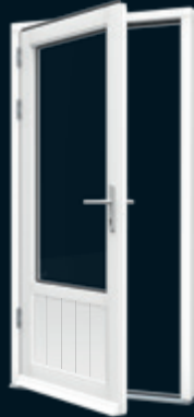
Part Glazed Grooved Panel