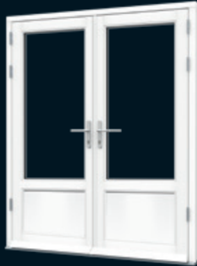
Part Glazed Plain Panel