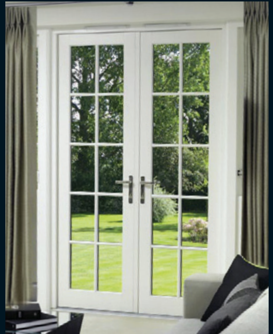
Timber double doors with 20 pane Astragal design upgrade