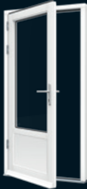
Part Glazed Plain Panel