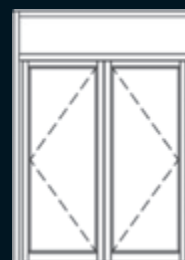
Single / Double Door with Fan Light