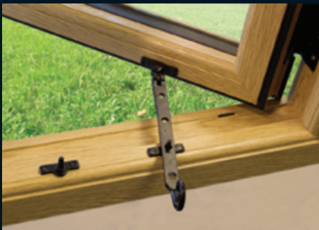
Dummy or functional stays upgrade