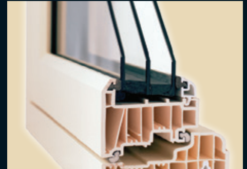
100mm outer frame for 28mm double glazing or 44mm triple glazing