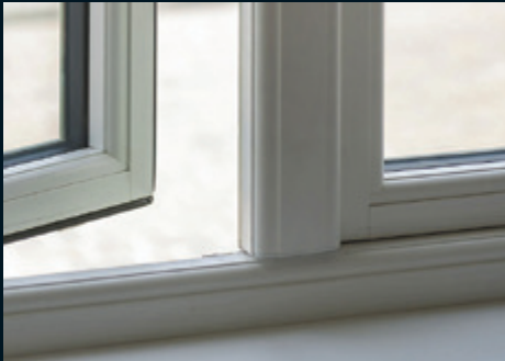
Residence9 has a traditional, decorative, internal finish