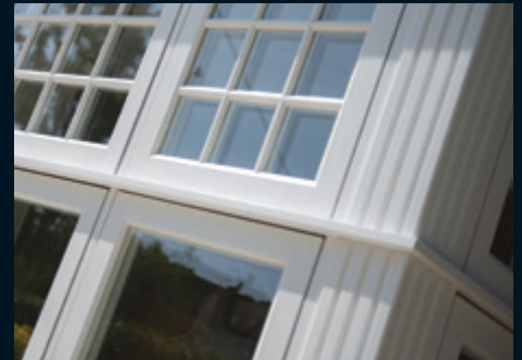
Flush external finishes with equal sightline and external transom bar upgrade