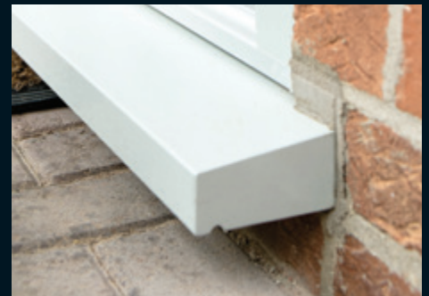
55mm Radlington cill option

Astragal Bar Grids supplied Fully Glazed