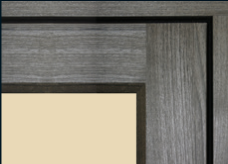
Standard - Fully mechanically jointed Option - Welded sash (Mech outer frame)

Residence 9 'Alternative to Timber' range is specifically designed to replicate 19th century timber windows and doors. With a flush external casement design and a decorative internal finish they are ideal when replacing 100mm traditional timber windows. A choice of styling options make them suitable for period and modern properties. Supplied Timberwelded as standard.