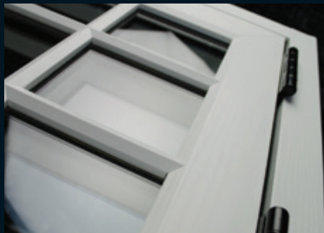
Dummy or functional butt hinges upgrade