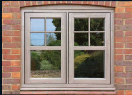
20mm Astragal and 60mm Transom bar upgrade